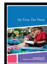
My Time, Our Place; Framework for School Age Care in Australia 2022 V2

Critical reflection: is a meaning-making process that assists informing future practice in ways that demonstrate an understanding of each child’s learning, development and wellbeing and implications for equity and social justice. It involves examining and analysing events, experiences and practices from a range of perspectives to inform future planning and decision-making ( Early Years Learning Framework 2022 V2 – refer to Sources ).